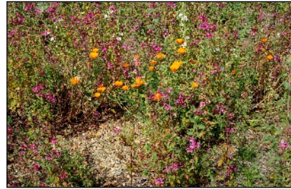
John Muir Visitor Center

Most of our weeds came from Europe with settlers. Weeds have some common characteristics; they grow quickly, they reproduce prolifically, they crowd out slower growing plants. Hence they reduce genetic diversity.