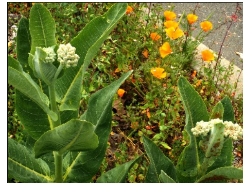
E Street Garden

Calflora (a website you can use to learn about plants that grow wild in California (both native plants and weeds) http://calflora.org