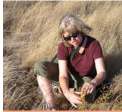
Collecting native plant seed on Mt. Wanda.

Community members are actively working to preserve the health of the Alhambra Creek Watershed. Individuals and groups participate in creek cleanups, restoration projects, and educational efforts to raise awareness about the importance of watershed health.