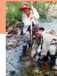
Collecting bugs to assess stream health.

health of our watershed. Our individual impact may seem small, but collectively our choices affect the health of the entire watershed. For more information about actions you can take, contact the Contra Costa Clean Water Program (in the City of Martinez, call 372-3515) or the Contra Costa County Watershed Program (in unincorporated areas of the county, call 313-2313).