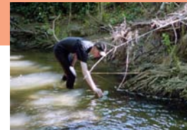
Monitoring water quality.