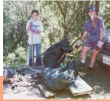
Keeping Alhambra Creek clean!