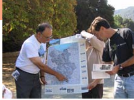
Discovering new places in the watershed.