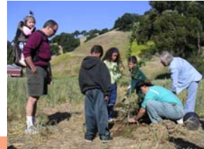
Restoring Strentzel Meadow.