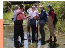
Surveying Alhambra Creek using GPS.

Want to know more? Visit the AWC website at www.ccrd.org or sign up on the mailing list to receive meeting information. Contact the RCD at 925-672-6522 x110 or carla-koop@ca.nacdn.net .