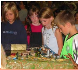
Learning how pollution affects watershed health.