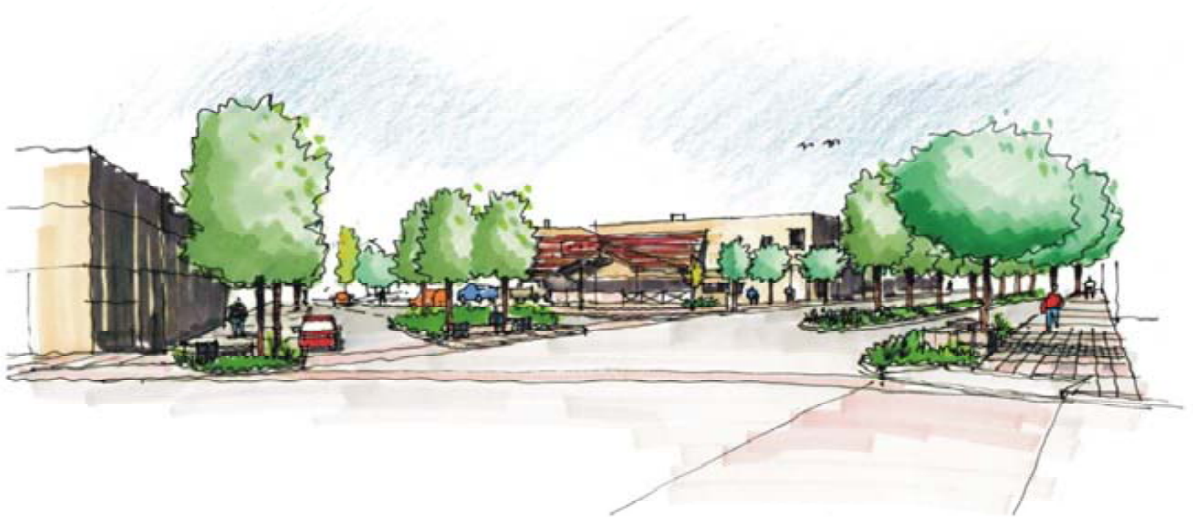
View Looking North PARKER AVENUE Rodeo, California